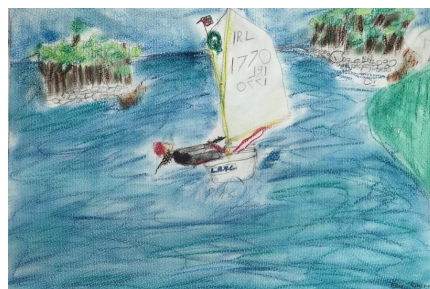
4. Ellie Byrne: "Lovely textured colour showing the rough water"