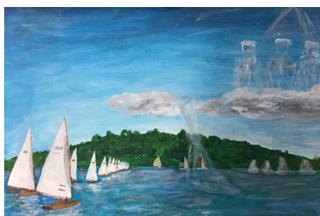
3. John Banim: "Wonderful composition that includes so much space and suggesting a lovely subject matter of a regatta taking place. The textured colours in the water give a great sense of movement."