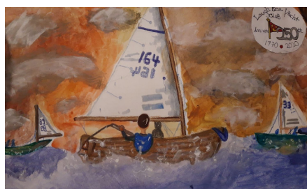
1. Isabel Leech: "Very dramatic image in its composition and colour, the effect of movement in the water is excellent"

(There's no fix here!! The paintings were judged anonymously with artist's names airbrushed out; Isabel only gets one prize!)