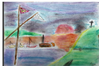
3. Mae Byrne: "Lovely use of pastels to create evening light in LRYC"