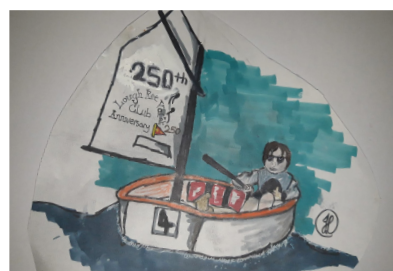
2. Isabel Leech: "Unique depiction of a sailor, love the creativity in using the sail to display the 250th anniversary of LRYC"