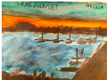
1. Nell Breen: "I love the warm sunset colours, showing a gorgeous evening in LRYC, you have captured it very well!"