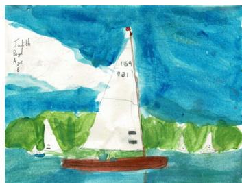
1. Judith Boyd: "Beautiful drawing, lovely variety in the tones of blue used, and in the rippling reflection of the sail in the water"