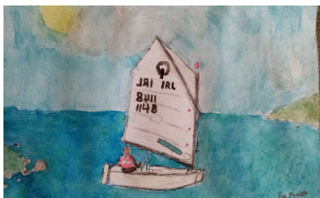
3. Eva Magner: "Great depiction of a Summers day on the water"