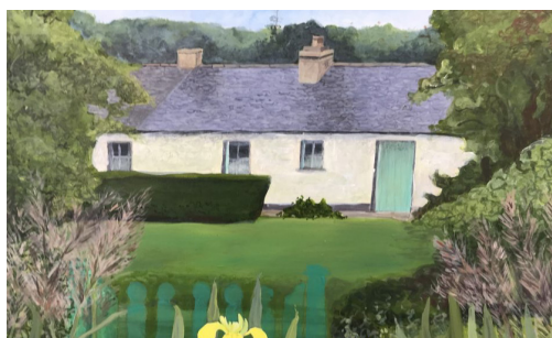
1. Daphne Levinge: "Painting, reminiscent of the artwork of William Leech in the foliage in the foreground. The roof of the cottage looks to be shining. A very calm and peaceful scene." Note: This is a depiction of Jimmy Fury's cottage.