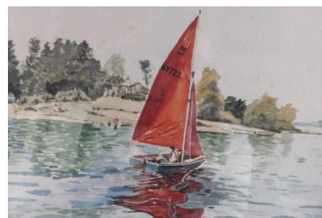
2. Josephine Hanley: "Absolutely beautiful painting. The shimmering depiction of light on the water makes me think of a hot summer's day in a haze of heat. The reflection of the sail in the water is mesmerising"