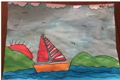
2. Bibi Laird: "Beautiful use of colour"