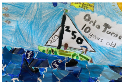
2. Orla Turner: "Your use of colour is very creative! Just like a choppy day out on the water"