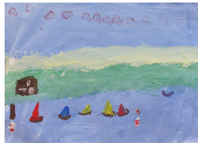
3. Eva Malone: "A very busy scene with lots of activity, a lovely composition"