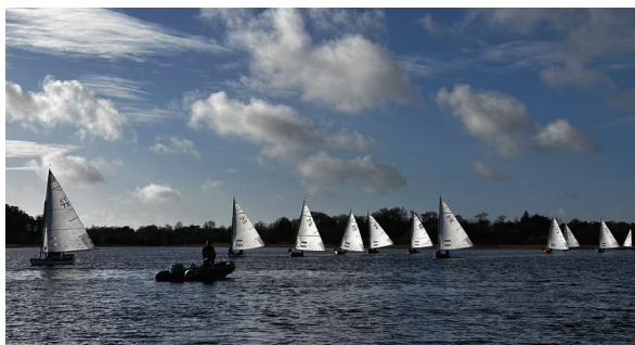
Shannon One Designs racing in Coosan Lough during the Inner Inner Lakes Regatta