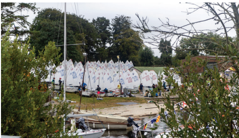
Optimist Fleet start rigging during the IODAI National Championship 2025