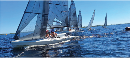
SB20 fleet rigging and racing at LRYC during the Midlander Championship in 2025.